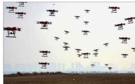
Above: Chinese facial recognition and profiling technology Left: Chinese military claims successful drone swarm attack test

PLEASE REVIEW THE STATEMENT ON THE OTHER SIDE OF THIS FLYER REGARDING VACCINATION REQUIREMENTS.