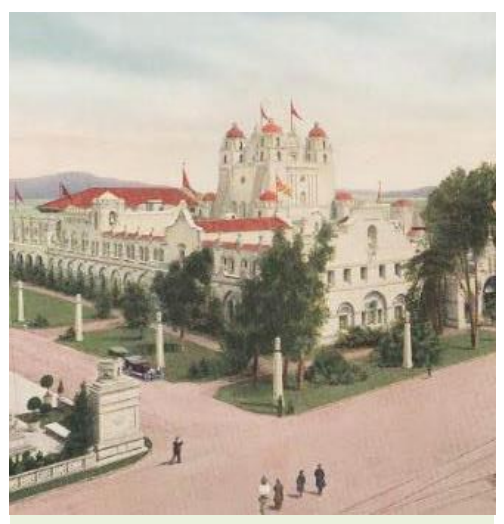
The California Building at the Panama-Pacific International Exposition; note that towers' design was inspired by the Santa Barbara Mission.

who work in a variety of media, publishing articles and essays ranging from stained glass to mural painting to sculpture. She has been a part-time lecturer for the Department of the History of Art and Architecture at UCSB for the past ten years.