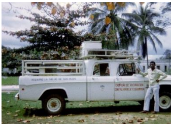
Throughout West Africa, villagers recognized the distinctive white trucks that carried the vaccines.

After a brief look at the political backstory, we’ll explore not only the expected challenges to smallpox eradication—logistics, communication, disinformation, politics, etc.—but also the unexpected—